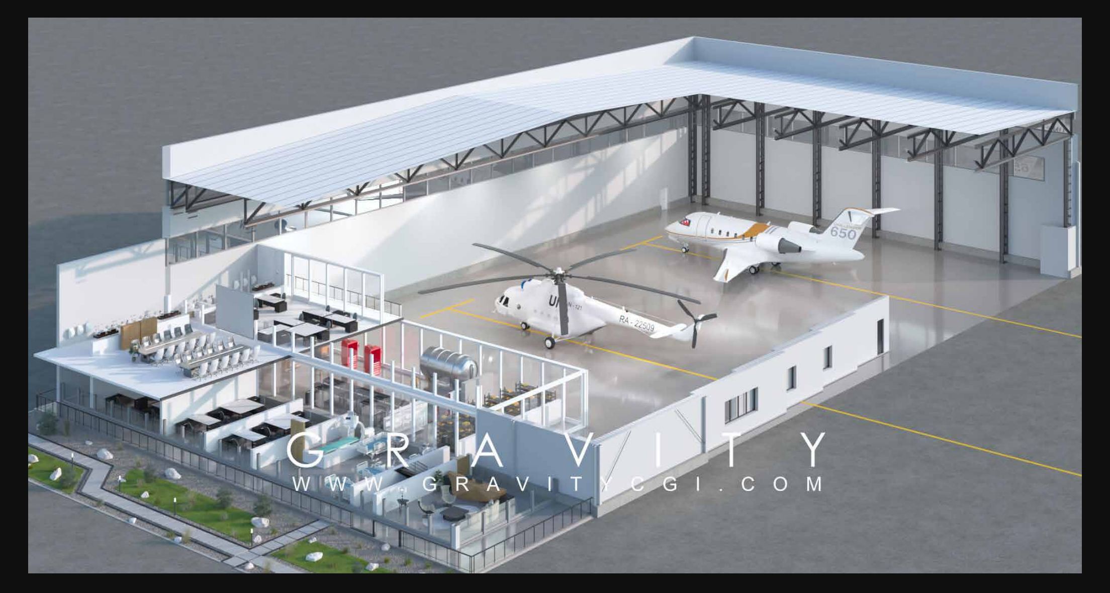
3D Floor Plans

Our 3D floor plans combine clarity with aesthetics, making layouts easy to understand and visually appealing. Ideal for real estate marketing, client presentations, and pre-sales engagement.